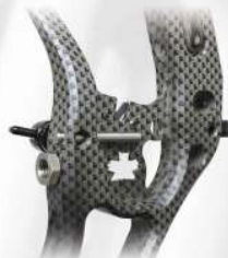
CAM LOCK PIN