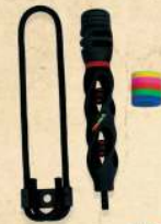
WRIST SLING / STABILIZER