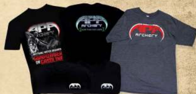
RED LOGO GREEN LOGO GREY T-SHIRT