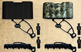
PREMIUM QUIVER 2PC