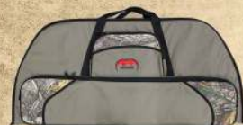
PADDED SOFT CASE